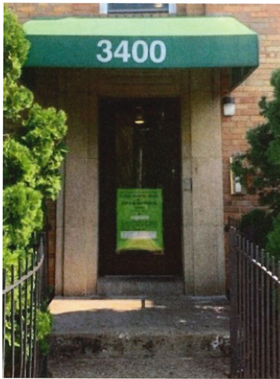
Re-posting of Notice 40: Taped to the front door of the building at 3400 B St., S.E., Washington, D.C.