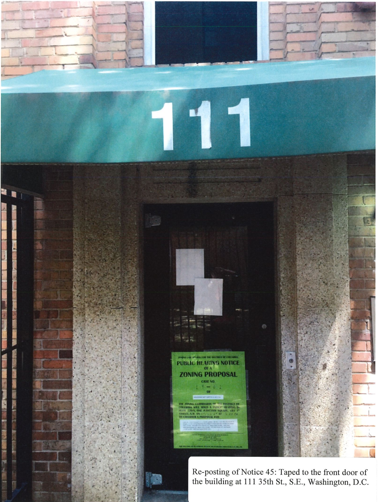
Re-posting of Notice 45: Taped to the front door of the building at 111 35th St., S.E., Washington, D.C.