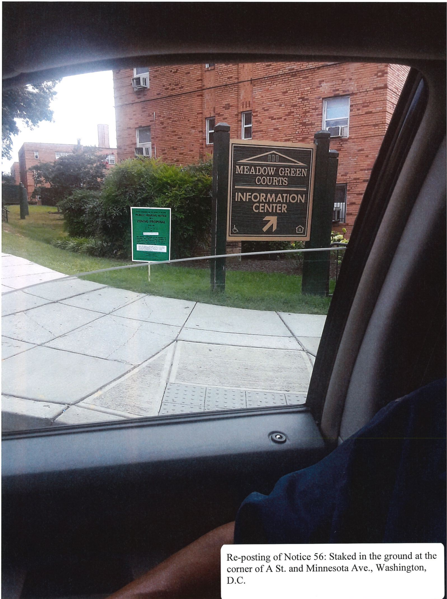
Re-posting of Notice 56: Staked in the ground at the corner of A St. and Minnesota Ave., Washington, D.C.